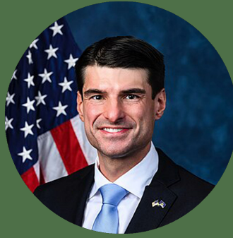
Congressman Rob Bresnahan

Staff representing the congressman's office